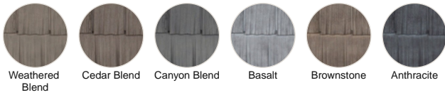
Weathered Blend Cedar Blend Canyon Blend Basalt Brownstone Anthracite